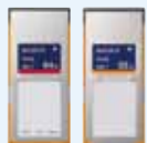
SBS-64G1A/SBS-32G1A SxS-1 Memory Card