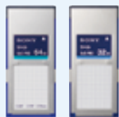
SBP-64A/32 SxS Pro Memory Card