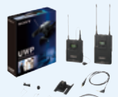
UWP-V1/V2 Wireless Microphone System