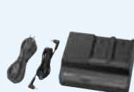
BC-U2 Battery Charger (2-slot)