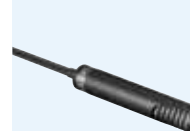
ECM-MS2 Stereo Microphone