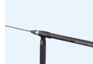
ECM-680S Stereo Microphone