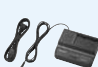
BC-U1 Battery Charger (1-slot)